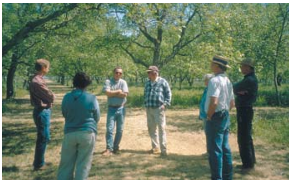
The BIOS implementation team, consisting of growers, UC advisors and technical experts, visited with growers at the beginning of the project to suggest strategies for reducing pesticide use.

* ns = Difference between BIOS and conventional blocks not significant. ss = Significant at P \leq 0.01 .