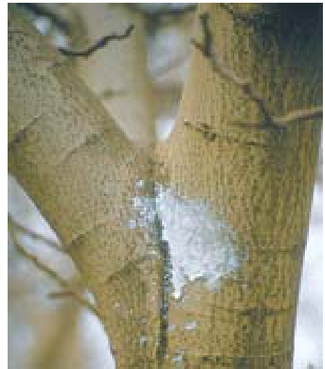
A variety of pheromone mating-disruption products were tested in BIOS and conventional orchards, including a recently developed wax emulsion applied using a pressurized handgun that projects the emulsion near the tops of trees.

A recently developed experimental wax emulsion containing codling moth pheromone (Atterholt et al. 1999; Grant et al. 2001) was made available to our project by the manufacturer (Gowan). We used the product in four BIOS blocks (B, E, F and G) in 1999 and three (B, H and L) in 2000. The pheromone emulsion was applied using a pressurized handgun applicator that projected a precisely metered stream of emulsion onto branches or leaves near the tops of