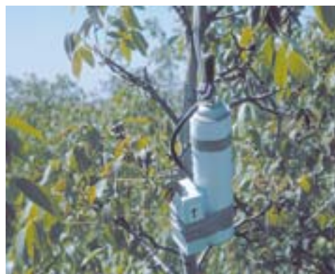
Pheromones can be applied in aerosol form, such as this experimental microsprayer, or "puffer," which releases precise doses at timed intervals.

A single application of CheckMate CM-XL1000 suppressed trap captures at the three sites where it was used in 2000 until mid-July, when a resumption of low-level trap captures indicated that the product was depleted of pheromone. The average weekly trap capture in these blocks was only 0.3 moths per trap before July 16; it was 5.3 moths per trap thereafter. This late-season activity was great enough to warrant chemical treatment at one of the sites. Two of the three blocks where this product was used had the greatest codling moth damage at harvest (4.3% and 2.2%) of all the mating-disrupted blocks.